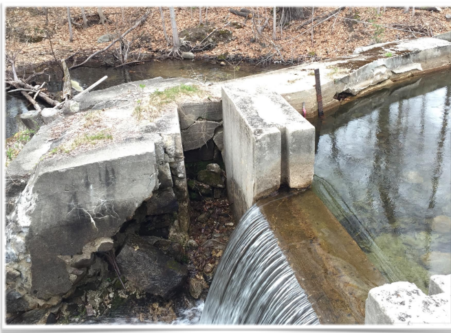
The existing dam structure

Much progress has been made over the past year on plans to renovate the Pleasant Lake dam in Casco. This 175 year-old structure has been repaired over the years, but is now in need of a total rebuild. The towns of Casco and Otisfield own the dam equally and are responsible for maintaining the water level of the lake and the dam itself. The collaboration between the selectboards' committee has been exemplary, the design for the new dam is complete, the contractors have submitted bids, and permitting has begun. Both towns will vote to approve the shared budget at their respective annual town meetings this June. If all continues as planned, construction will commence this coming fall. Our lake association has had active involvement, will continue to participate as the project moves forward, and will be assisting by contributing a portion of our donations to the project. Hopefully by next summer a new, secure, and functioning dam will be in place, ready to serve Pleasant Lake for another 100+ years.